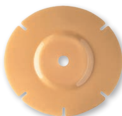
CONVEX WAFER with Flexifit® and Aloe extracts