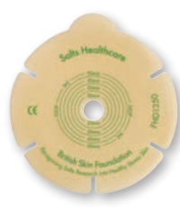
STANDARD WAFER with Flexifit® and Aloe extracts