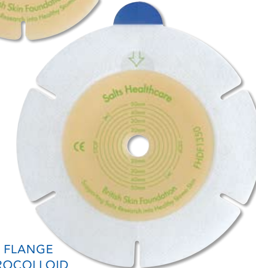
FLEXIFIT FLANGE WITH HYDROCOLLOID SURROUND