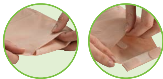
DRAINABLE POUCH FOR ILEOSTOMISTS