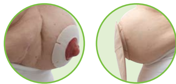
FLEXIFIT WAFER ON A HERNIA