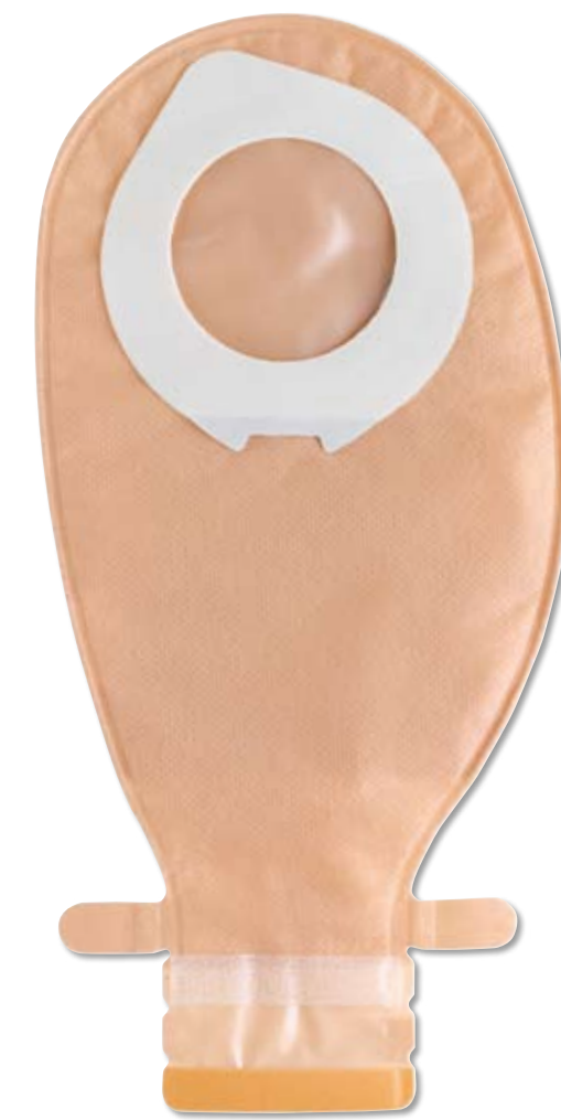
DRAINABLE POUCH FOR ILEOSTOMISTS

Those who enjoy the convenience of a two-piece system can also benefit from an improved fit, thanks to Harmony ® Duo. These discreet pouches now feature the unique Flexifit flange, which fits closely to any body shape; and a softer hydrocolloid surround, giving you greater freedom of movement. With stronger adhesive to keep your pouch firmly in place and Aloe extracts to help soothe the skin, Harmony Duo offers our most comfortable and secure fit ever.