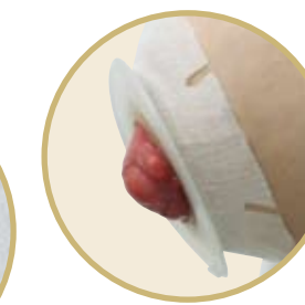
FLEXIFIT FLANGE ON A HERNIA

Those who enjoy the convenience of a two-piece system can also benefit from an improved fit, thanks to Harmony ® Duo. These discreet pouches now feature the unique Flexifit flange, which fits closely to any body shape; and a softer hydrocolloid surround, giving you greater freedom of movement. With stronger adhesive to keep your pouch firmly in place and Aloe extracts to help soothe the skin, Harmony Duo offers our most comfortable and secure fit ever.