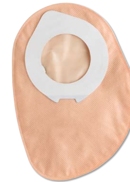
CLOSED POUCH FOR COLOSTOMISTS

Excellent flexibility and adhesion, ideal for hernias or uneven skin.