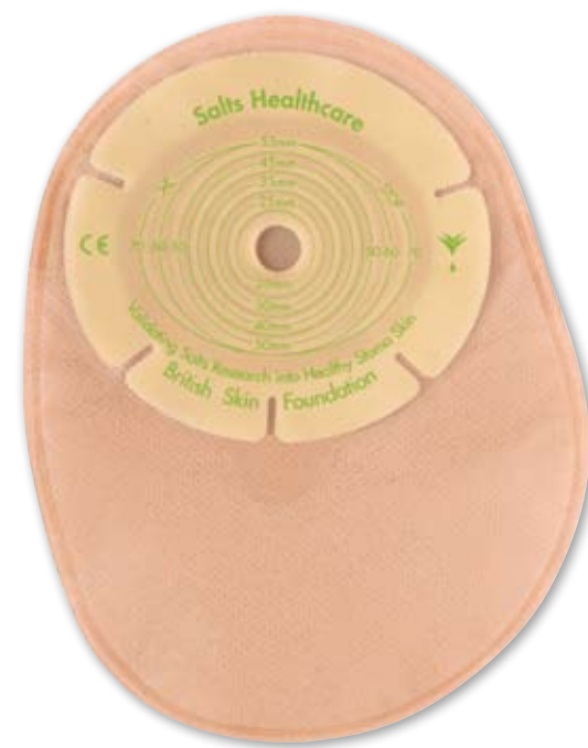
CLOSED POUCH FOR COLOSTOMISTS