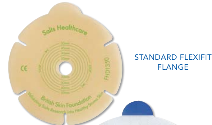
STANDARD FLEXIFIT FLANGE

Harmony ® Duo with Flexifit ® Flange & Aloe Extracts