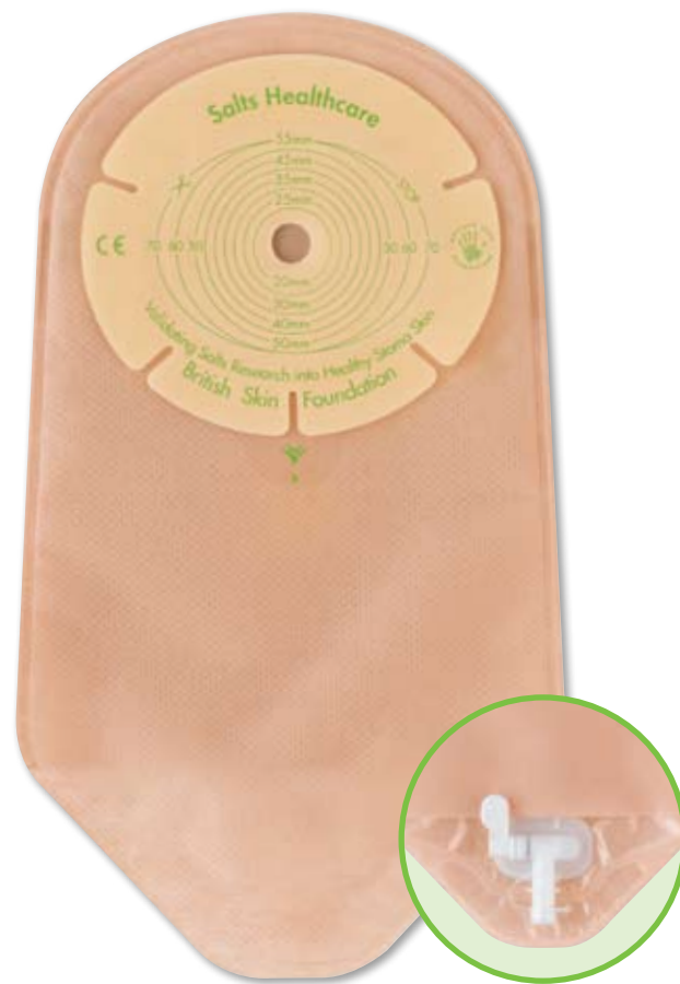
UROSTOMY POUCH WITH TAP